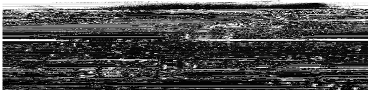
Figure 1. Aerial view of the study area showing the location of the study site (red box) and the location of the study site (red box).