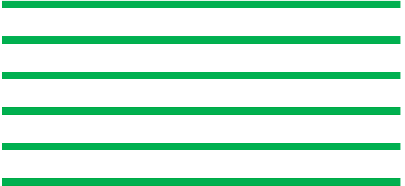
Figure 26: Canopy Cover Percentage along Medium Density Transect.